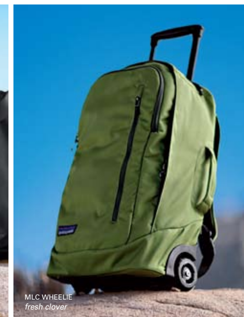
MLC WHEELIE fresh clover