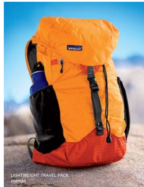
LIGHTWEIGHT TRAVEL PACK mango