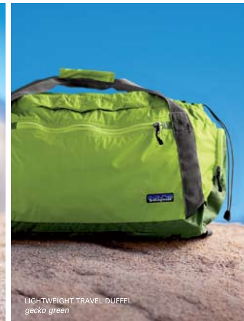
LIGHTWEIGHT TRAVEL DUFFEL gecko green