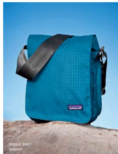
SINGLE SHOT seaport