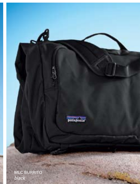
MLC BURRITO black