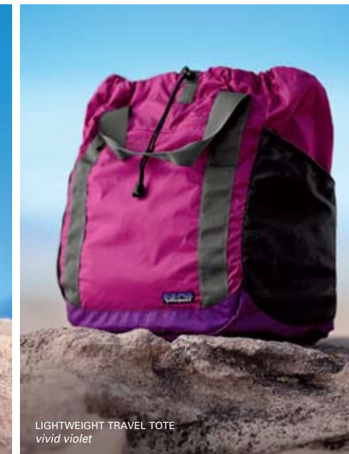
LIGHTWEIGHT TRAVEL TOTE vivid violet